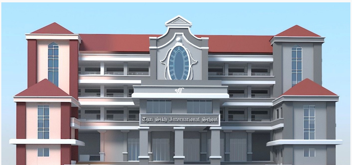
Our senior school will begin a series of upgrades in December-January.